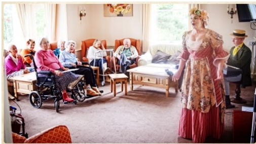
Seven Gables, Totland Bay, IOW

The tour had covered nine hundred and fifty three miles and had benefited over three hundred elderly vulnerable, frail or disabled people in six counties.