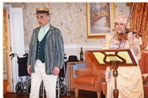
The Pines, Putney, Lond

The financial year ended with a March series of concerts in London and the Home Counties: The Pines, in Putney, Alexander House, East Sheen, Viera Gray House, Barnes Greville House, Richmond-upon-Thames, Sheen Lane Day Centre, and Speirs House, New Malden, Surrey. In total forty-two venues had been reached during the financial year.