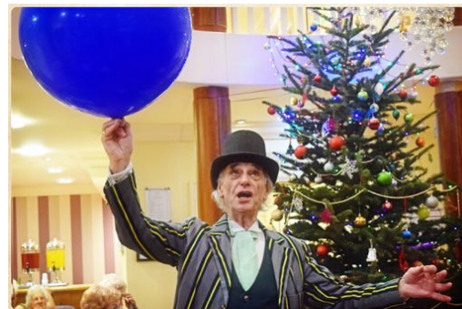
Gracewell in Sway near Lyminster.

The Balladiers went to Hampshire on Monday of the second week visiting Countess of Brecknock hospice in Andover and Sunrise of Winchester. In an action packed day on Friday, 15 th December they visited Forest Court, Calmore, Seven Gables on the Isle of Wight and