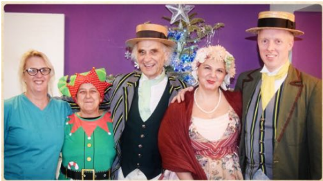
Birchlands Care Home, Haxby, York

The third and final week required much longer journeys. At the first venue, The Manor House in Barnard Castle, they were perfectly happy to arrange a slightly later start due to the group's traffic delays. Time was made up for the second venue, Glenholme House in Sunderland, where the show started promptly. The Balladiers then stayed overnight in Washington so the drive south took only an hour. At Boroughbridge Manor a large and lively audience was in party mood and the show went exceptionally well. The next was in St John's House, Kirk Hammerton, before the short drive to The Elmbank Hotel in York for the night.