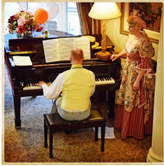
Sunrise of Solihull