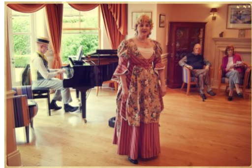
Royal Star & Garter Home, Solihull

enlarged beneficial area. Both shows were well attended and well received. There was much more travelling the second day with an afternoon show at Royal Star & Garter, Solihull and an evening show at Rosevale, Wigginton near York before the group drove to Scotch Corner for the night. The next morning's show was in The Manor House, Barnard Castle following the highly successful first appearance there last December. The drive to Sunderland was uneventful with just enough time to spare for lunch on the sea front in Roker before the afternoon show in Glenholme House. The evening show at Nightingale Hall in Richmond though delayed by a major traffic accident was nonetheless successful.