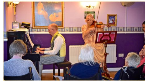
Greville House, Richmond-upon-Thames

After a joint rehearsal on Sunday, 3 rd December the tours began on Monday, 4 th December with concerts in Cecil Court, Kew and Viera Gray House, Barnes. These shows together with those the following day in Greville House, Richmond and Alexander House, East Sheen, were the final ones in the current RPLC series. On Wednesday 6 th the Group visited two homes in Kent: Staplehurst Manor which is a BUPA home and Rivermere, a care home in Sevenoaks, formerly a Sunrise Home but now run by Avery Healthcare.