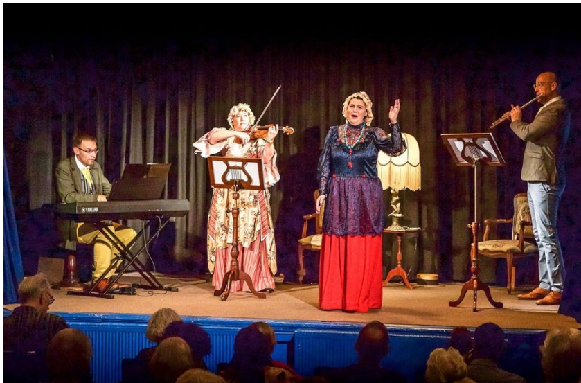
The Malt Theatre, Lymington, Hants